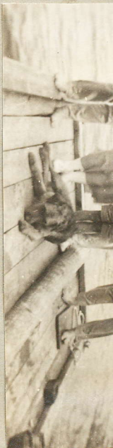
1925: THE DALE FAMILY