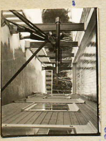
The telescope on the veranda of the New House. It was also useful for spying on those in boats on the lake, or in this case skating or skiing.