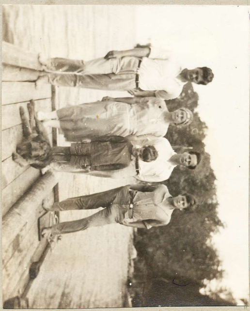
1925: THE DALE FAMILY