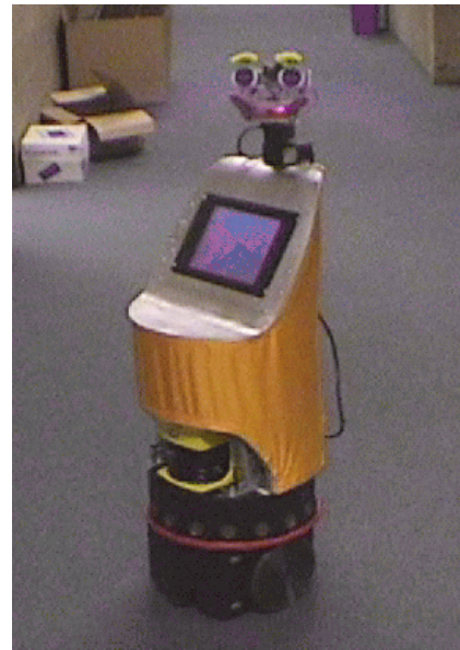
Figure 1: Side view of Flo, the robot. The robot is equipped with a touch-sensitive display, a laser range finder, an array of 16 sonar sensors, and two on-board PCs.

The current prototype robot, called Flo (in honor of Florence Nightingale ) is shown in Figure 1. Flo is built on top of a Nomad Scout differential drive mobile base, equipped with 16 ultrasonic range finders. The custom-made robot is equipped with a SICK PLS laser range finder, capable of measuring distances at an angular resolution of one degree and a spatial resolution of 5 cm, within a planar perceptual field that covers a 180 degree range. Flo is also equipped with two on-board PCs, connected to the Internet via a 2mbit/sec wireless Ethernet link manufactured by Breeze-Com. A bright, touch-sensitive color display is mounted conveniently at approximate eye height for sitting people. On top of that, FLO possesses an actuated face that