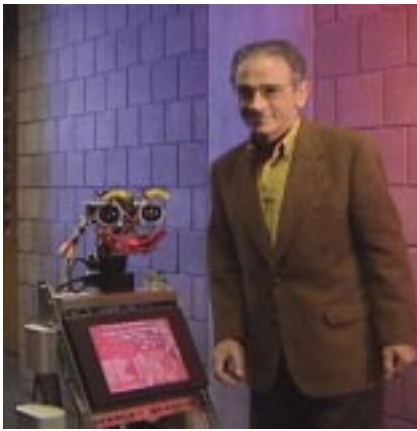
Figure 2: Flo interacts with a person.

The tele-presence interface consists of a camera and microphone on-board Flo, that transmit the video and audio signal to a remote station. Both camera and microphone are mounted inside Flo's head, to provide as robot-centric a representation as possible. The video feed is compressed into a JPEG feed on board, and then both signals are transmitted to a local base-station over the wireless Ethernet, and then to a remote station. At the remote station the JPEG is decompressed and synchronized with the audio before they are played back on the remote computer's screen and speakers. JPEG cards are used instead of the higher compression afforded by MPEG cards, because MPEG compression causes a significant latency in the signal transmission, usually around .25sec and enough to be annoying 1 .