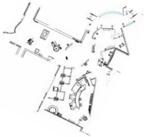
Figure 4: Left: Map of the environment shown graphically on the right. This map covers a large open area in the Tech Museum in San Jose, CA. The floor plan was developed by the building’s designers; not every line therein corresponds to an actual obstacle (and vice versa). As can be seen, the map is accurate.

new home. Homes do not have to be modified in any way to facilitate robot navigation.