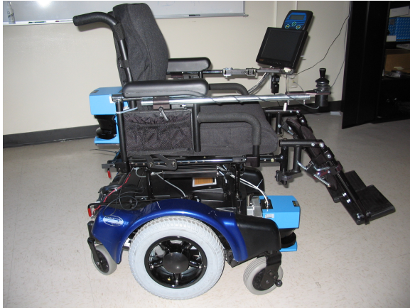
Figure 1: The SmartWheeler robot platform.

tors [3]. The main contribution of the authors is in the development and validation of the human-robot interface. Figure 2 presents an overview of the software architecture controlling the human-robot interface onboard the robot. The primary mode of interaction is a two-way speech interface. We employ a number of technologies to achieve robust interaction, including natural language processing (automatic speech recognition and grammatical parsing) and high-level dialogue management using Partially Observable Markov Decision Processes. A tactile/visual interface system is also installed, and used primarily for provided visual feedback to the human regarding the state of the dialogue system.