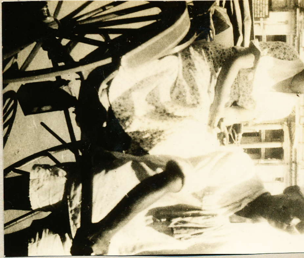
Nov. 1933 Rickshawing in Ceylon (Sri Lanka)