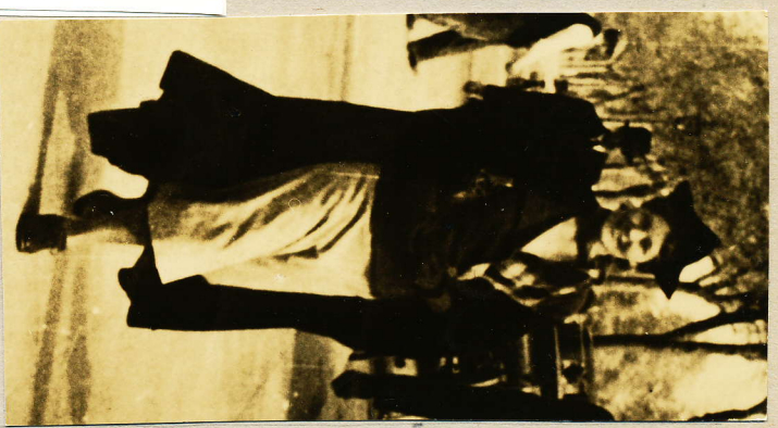
APRIL 1933 OXFORD