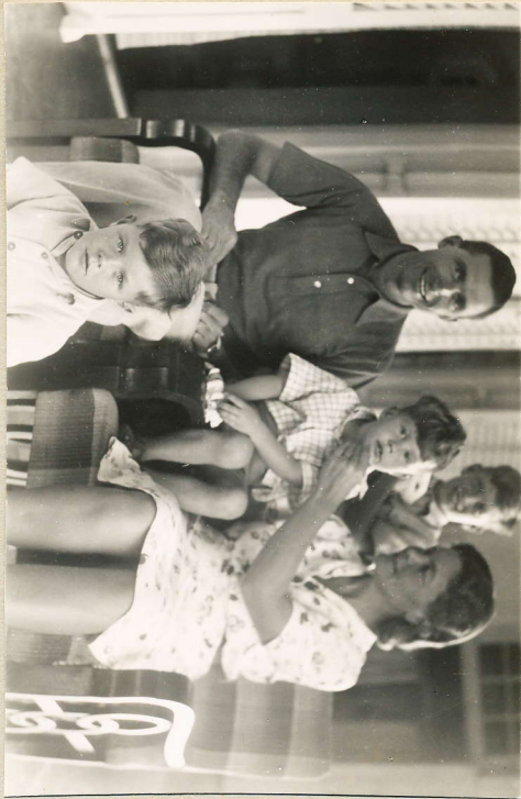
JAN. 1946 CHATRATUR, INDIA. THE COLLECTOR'S HOUSE