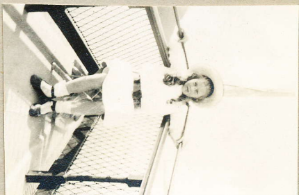
IN THE ROW OF THE ANTHEMIS

B. 4 FEB. 1907 M. 1 OCT. 1932 D. 6 JULY 1957